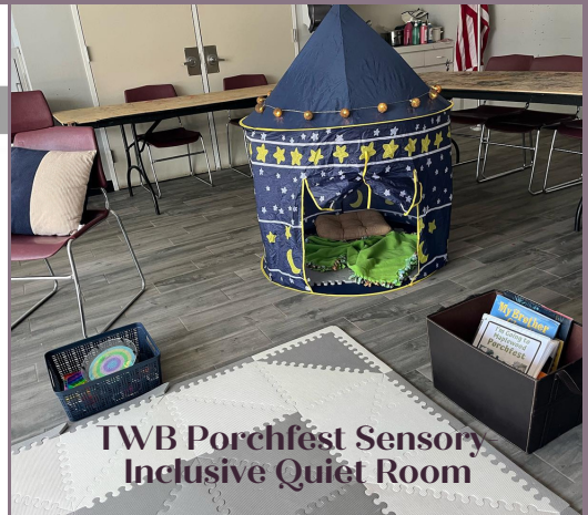
TWB Porchfest Sensory Inclusive Quiet Room